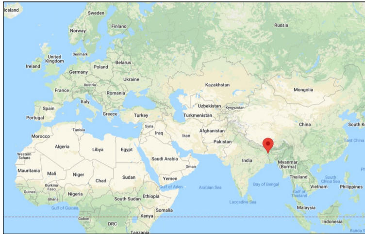
Pupils at Sutton will be connecting with children 4,824 miles away!