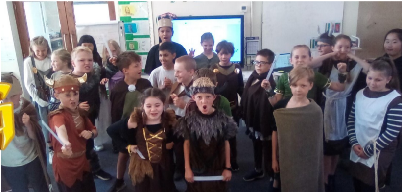
Pupils in Years 3, 4 and 5 enjoyed their very own 'Viking Day' on Thursday 9th June.